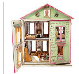
Home Design Fall 2010: Family Edition