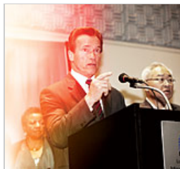
The End of the California Dream

Debbie Downer Michael Kay Implied to a Theater Full of Yankee Fans That They Wouldn't Repeat in 2010