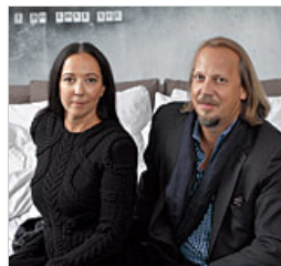
Roman and Williams on Making New Spaces Old

Is this Choreographer Madonna's New Boyfriend?