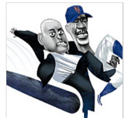
Mets Finally Realize They Have to Start Over